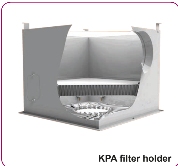
KPA filter holder

When the battery needs replacing, the device lights up blue, indicating that the battery is below the threshold for optimal operation and needs to be changed. Flashes BLUE every 6 seconds.